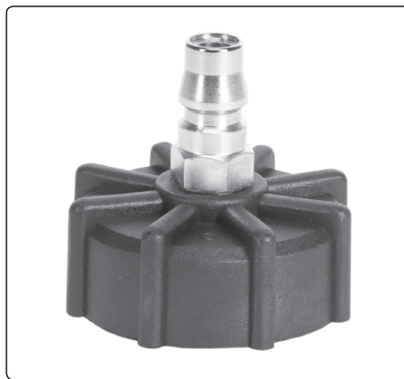
Straight Adaptor - Model No. VS820SA.